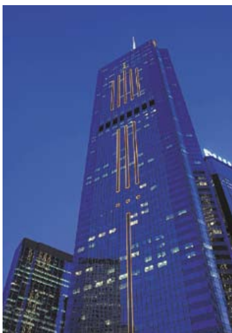
Hong Kong- Asian headquarters